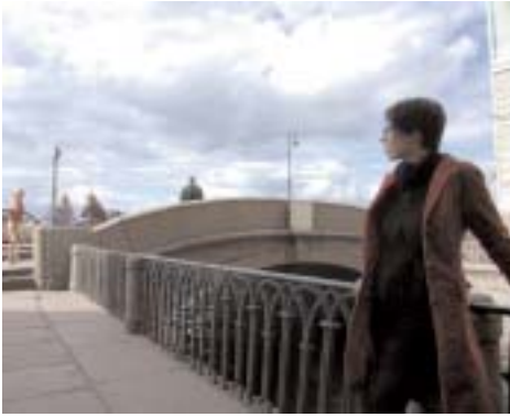
Author by a canal in St. Petersburg

T his year was the 300th anniversary of the city of St. Petersburg, Russia. The city, founded by Peter the Great in the marshlands along the Neva River, is a treasure trove of visual and performing arts. Tango is no exception. I was lucky enough to have the opportunity to visit the city at this historic time and was able to find the thriving local tango scene.