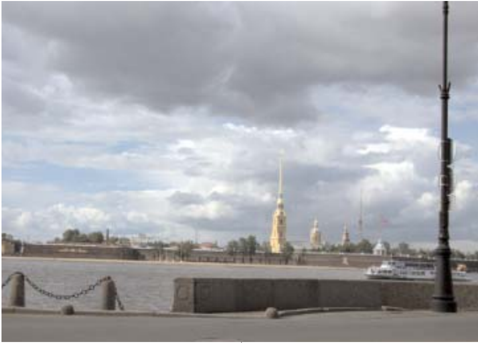
View of Neva River in St. Petersburg

milonga inside through a large open window – it was just easier. For this special barbeque milonga they also had various types of drinks, including piña colodas and red champagne. The host of the milonga, Elvira (no not the Mistress of the Dark), made a point to introduce us to various people throughout the evening and continuously encouraged everyone to dance. Everyone was very friendly at this milonga too. As with the other milongas,