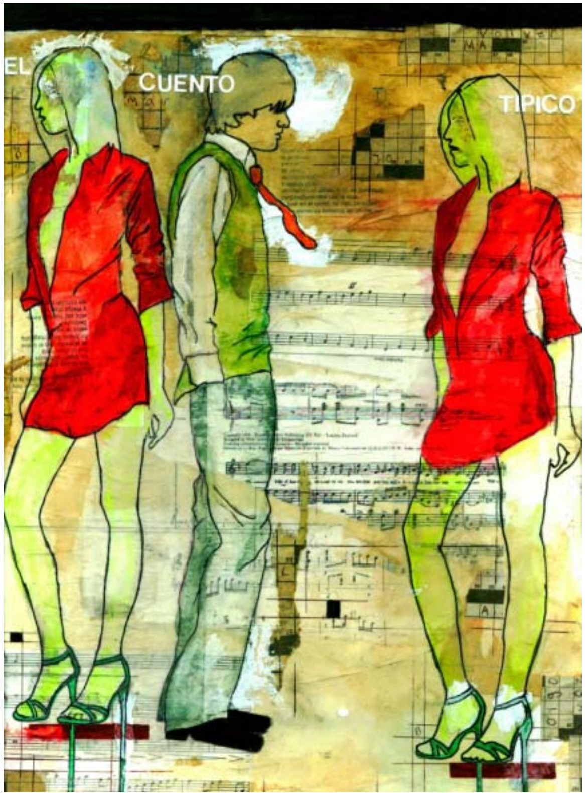
Cover Art by Yanira Collado

APRIL 2004, VOLUME 05, ISSUE 04 www.tangonoticas.com