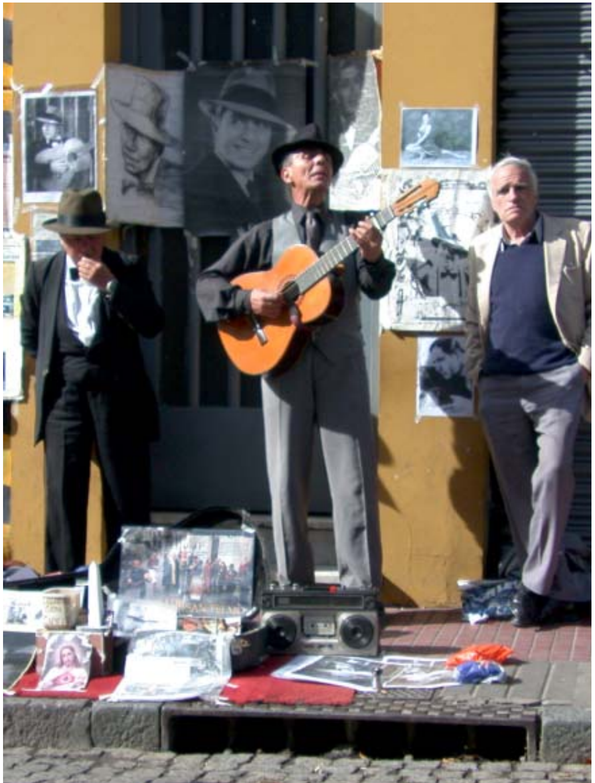
Street Performers in San Telmo, Buenos Aires, Argentina

AUGUST 04, VOLUME 05, ISSUE 07 www.tangonoticas.com