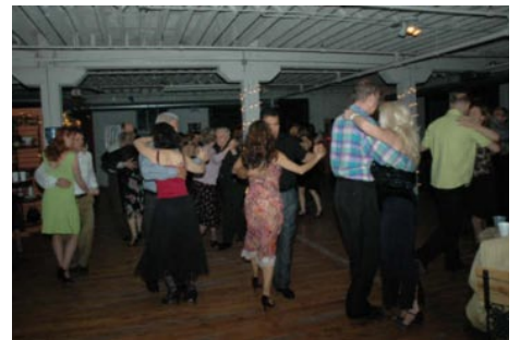
Dancing at Mariposa